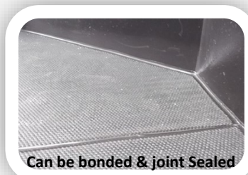
Can be bonded & joint Sealed